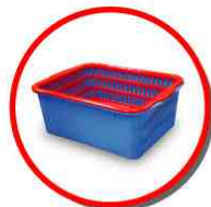
No.827 長方篩 Utility Tray

外度Overall Dimensions 520 x 398 x H.170mm (20-1/2" x 15-5/8" x H.6-5/8") 內度Internal Dimensions 頂Top 458 x 360 x H.155mm (18" x 14-1/8" x H.6-1/8") 底Bottom 355 x 260 x H.155mm (14" x 10-1/4" x H.6-1/8")